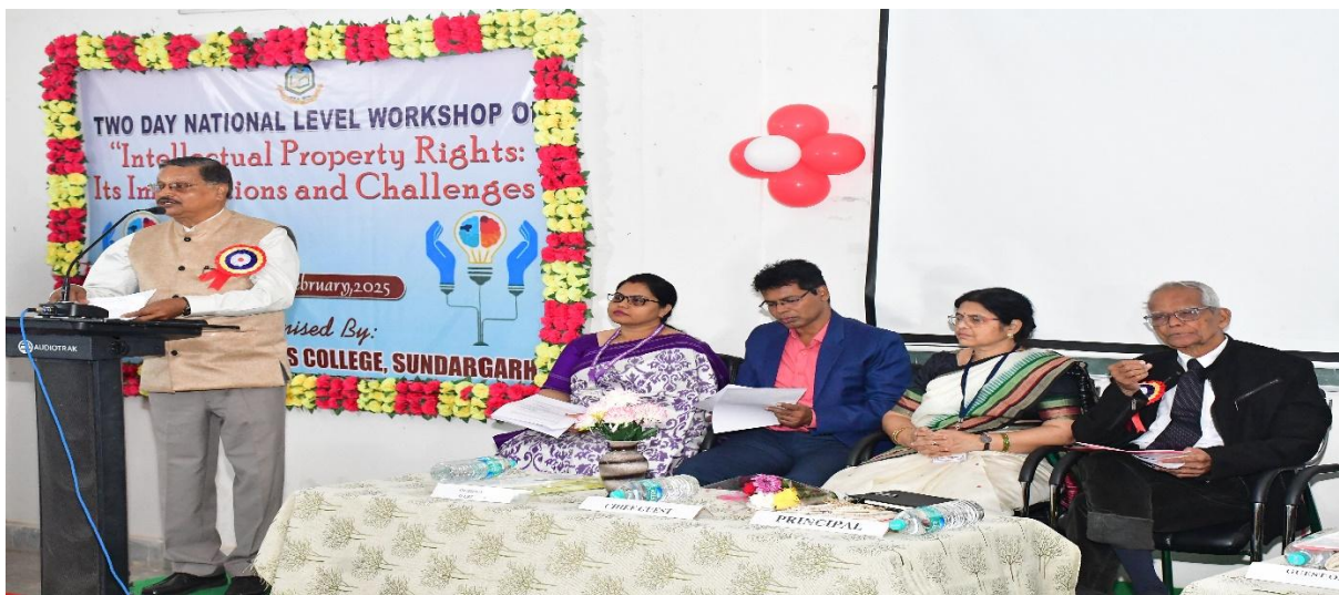
(Deliverance of speech about Intellectual property rights by Chief guest, Guest of Honour and Principal of Govt, Women's College Sundargarh)