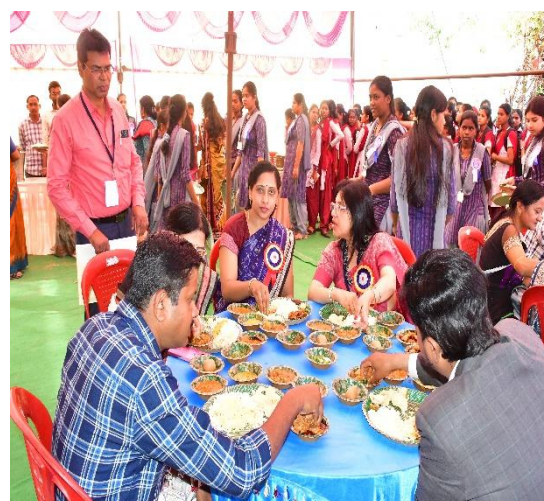
(Dining of Delegates)