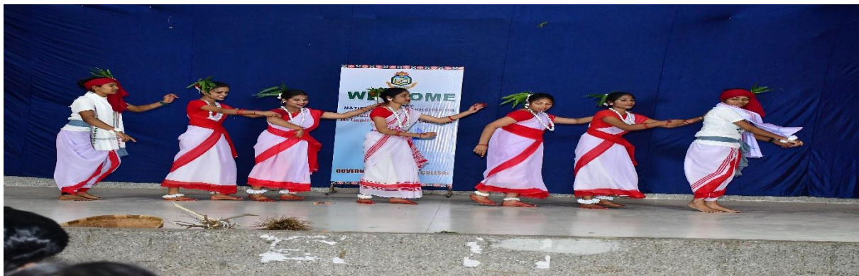
(Cultural Programme on Eve of National Workshop)