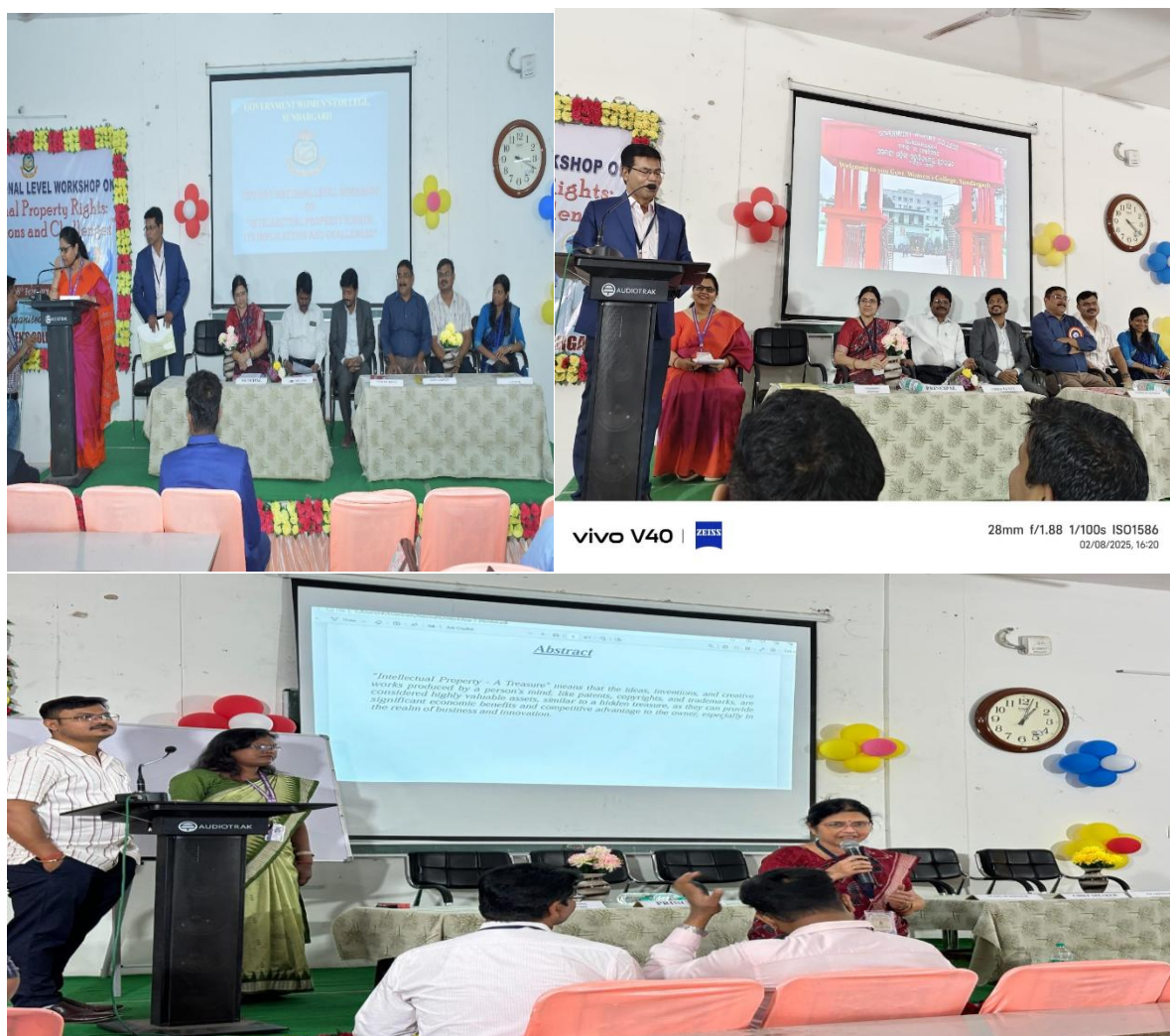
Valedictory session and closure of the workshop