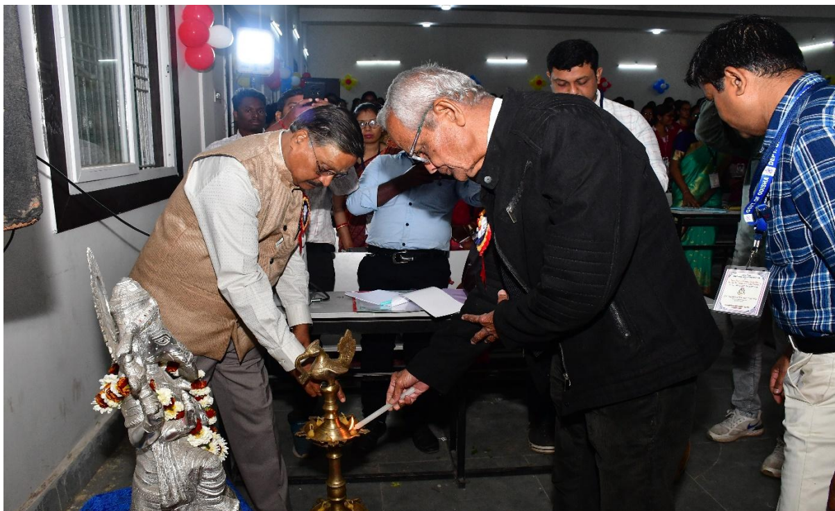
(Lightening of Lamp)