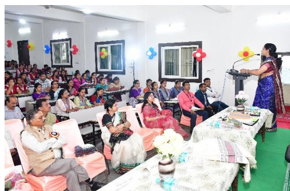
(Deliverance of speech on IPR by Recourse persons on 1 st day of workshop)